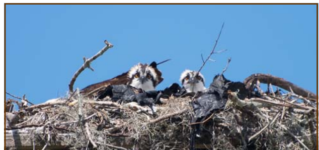
Osprey chicks stare down the intruders while mom does housework, at Rock Ponds.