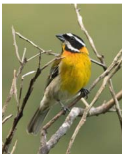
Puerto Rican Spindalis

Reservations are now open for our next big trip, to Puerto Rico in the Spring of 2018. This trip makes a circle around the island, visiting a variety of habitats and finding plenty of birds. We should find all the island endemics and more.