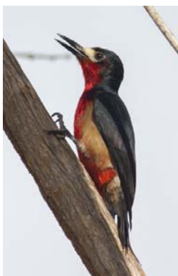
Puerto Rican Woodpecker Tom Johnson

Cost is $2475 per person, double occupancy, with a single supplement of $450. This covers hotel and dinner on the 23rd, through breakfast and drop off at the airport on the 29th. Alcohol and personal items are not included, but all meals, transportation, guide and tips are included.