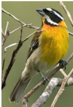
Puerto Rican Spindalis

Day 7 we breakfast in El Yunque, then return to San Juan for the flight home.