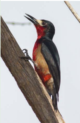
Puerto Rican Woodpecker, Tom Johnson

Only 7 spaces left! Circle the island, find all 17 endemics and more, with good food, a great guide (Tom Johnson, of Field Guides) and easy walking! Cost for the 7 days, including the first dinner in San Juan and until delivery to the airport on Day 7, is $2,475 per person double occupancy. Single supplement is $450. Airfare, alcohol and personal items are not included.