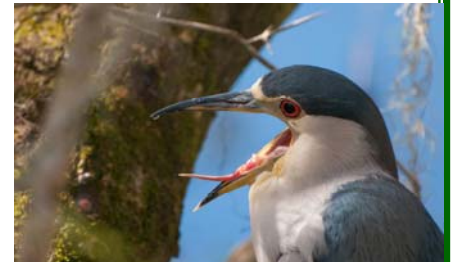
Birds' reaction to proposed cuts!

Congress is back in session, and passing an appropriations bill will be necessary in order to avert another government shutdown on Friday. While this will not be specifically about the Trump budget proposals for next year, it will have everyone focused on spending priorities. In his recent budget proposal, he seeks a 31% reduction in funding for the EPA, leading to a 20-25% reduction in staff. This would greatly hinder the agency's ability to carry out even routine inspection and monitoring activities. The proposal also calls for termination of large-scale regional environmental cleanup programs in Chesapeake Bay and the Great Lakes, elimination of more than 50 other ongoing EPA programs, and cutting R&D funding for the agency by roughly 50%. It would eliminate nearly all grants made by the EPA to independent researchers studying environmental issues. It would kill the Tampa Bay Estuary program, which has been enormously successful in cleaning up the waters of