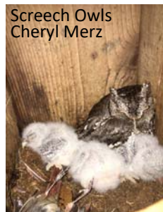
Screech Owls Cheryl Merz

It's our traditional grand finale of the year, with the Photo Club members showing off their best shots of the past season. There are usually photos for sale, so if you need something for your own home, or a one-of-a-kind gift for someone special, this will be your chance!