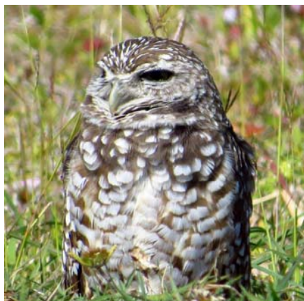
Photo of a Cape Coral burrowing owl