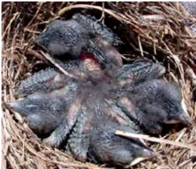
Bluebird chicks 10 days old