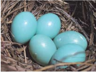
Bluebird eggs in nest