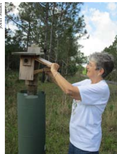
Tampa Audubon Society Bluebird Monitor cleaning a nestbox

Flatwoods Park is a Hillsborough County Park that has a seven-mile paved bike path, as well as many unpaved wilderness trails. The fifty-one bluebird boxes are located along the bike path and are maintained by Tampa Audubon Society and the Park staff.