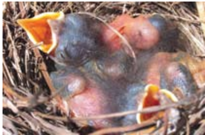
Bluebird chicks a few days old